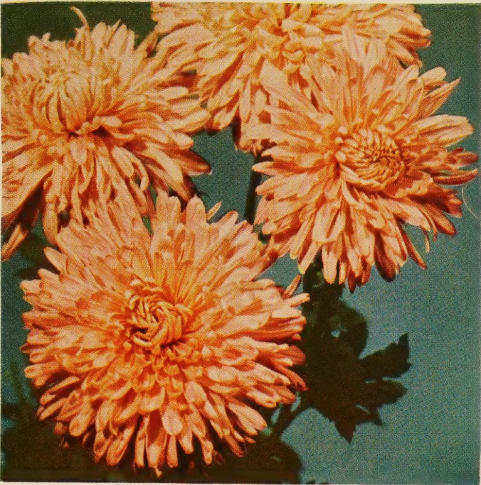
PATRICIA LEHMAN. 60c each; 3 for $1.50